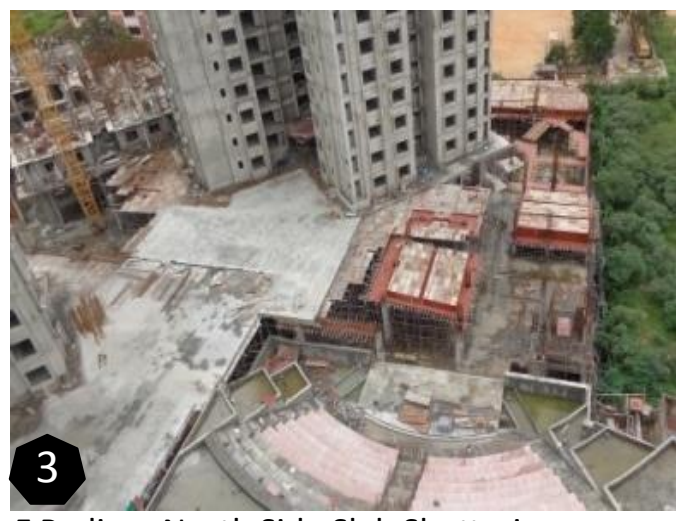
F Podium North Side Slab Shuttering ,Reinforcement and Concrete in Progress.