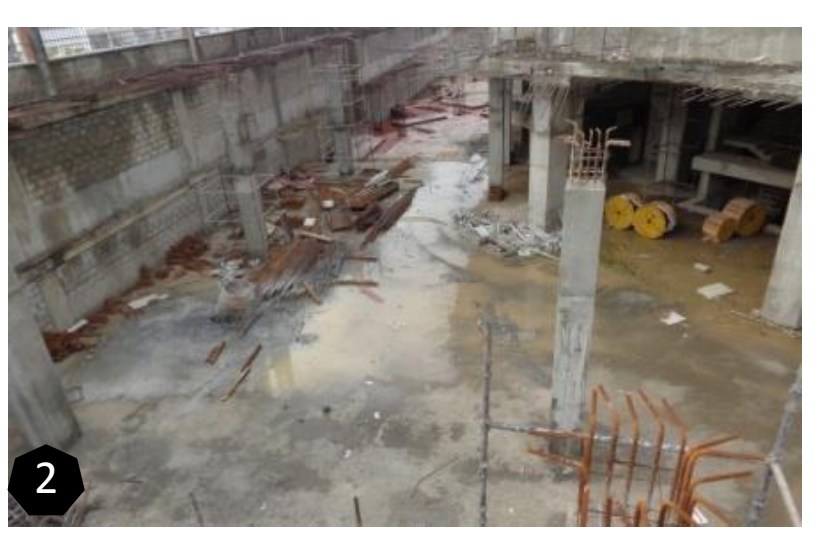
A & B Podium North Side Shuttering in Progress