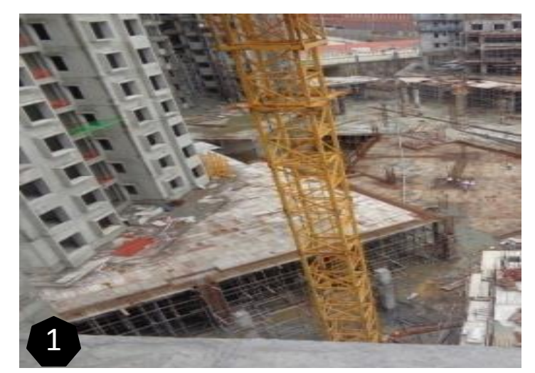
C, D,E South Side Podium Shuttering and Reinforcement in Progress